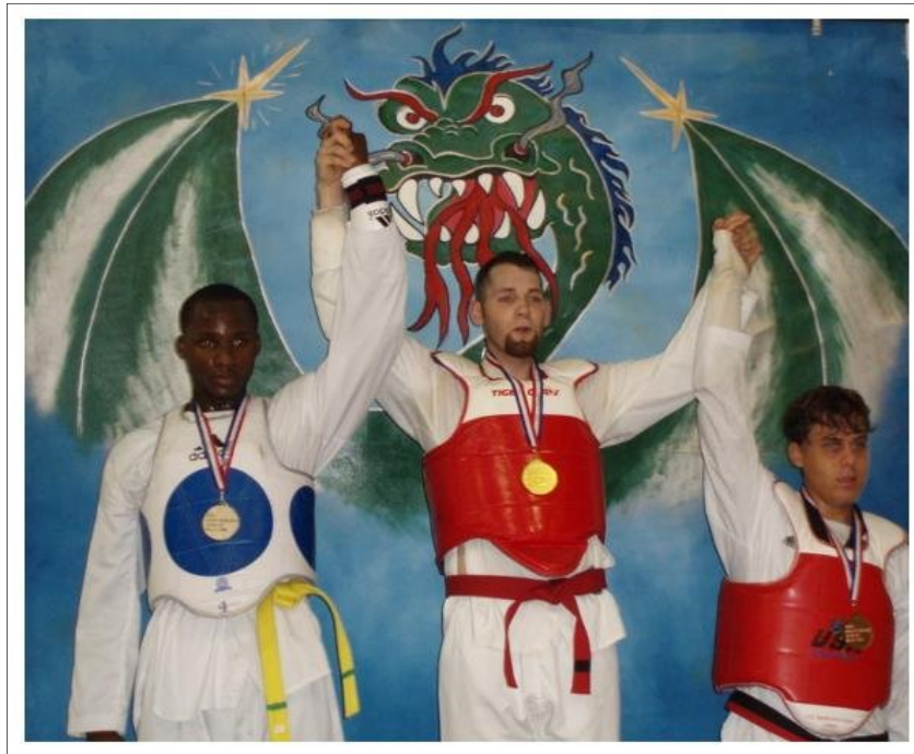
“The Great Dragon”

And the great dragon was cast out, that old serpent, called the Devil, and Satan, which deceiveth the whole world: he was cast out into the earth, and his angels were cast out with him. (Revelation 12:9 KJV)