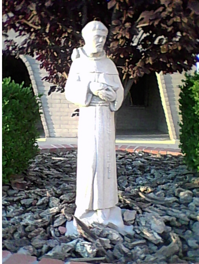
Statue of St. Francis of Assisi

The picture above and the picture of the demonic figure in the plaque are St. Francis of Assisi. They are both graven images and can be worshipped as gods. The plaque above says, "Prayer To St. Francis" and that means you are making and worshipping St. Francis as a god. The same goes with the statue of St. Francis. That is why in Exodus 20:3-4 God Almighty commands us not to worship any graven images as god. The god you worship through the St. Francis plaque and St. Francis statue are either Satan or his Demons.