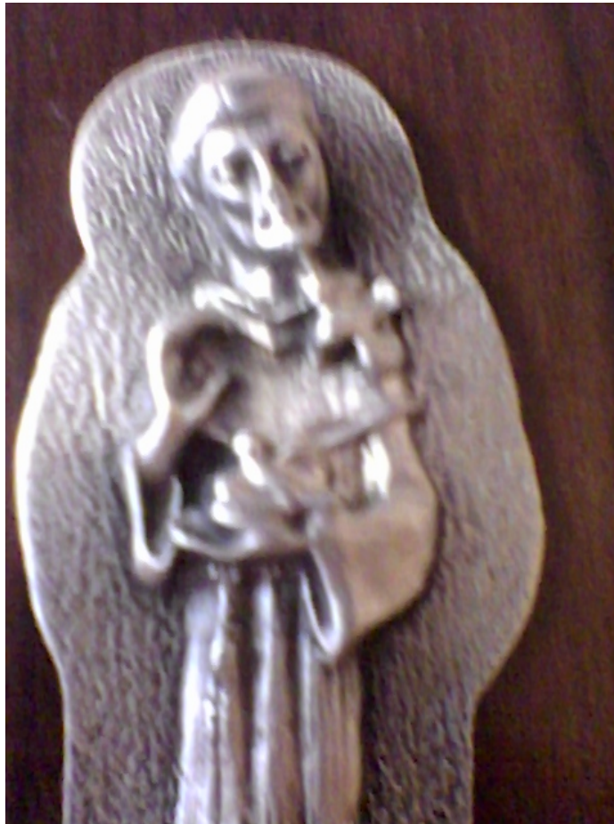
Top of Plaque St. Francis of Assisi

(Exodus 20:3 KJV) Thou shalt have no other gods before me.