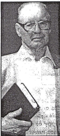
'JIMMY SHOULD find himself a REAL woman! says W.L. Swaggart.

Christian empire, including the 7,000-seat Family Worship Center, means as much to Frances, 53, as it does to Jimmy, say pals.