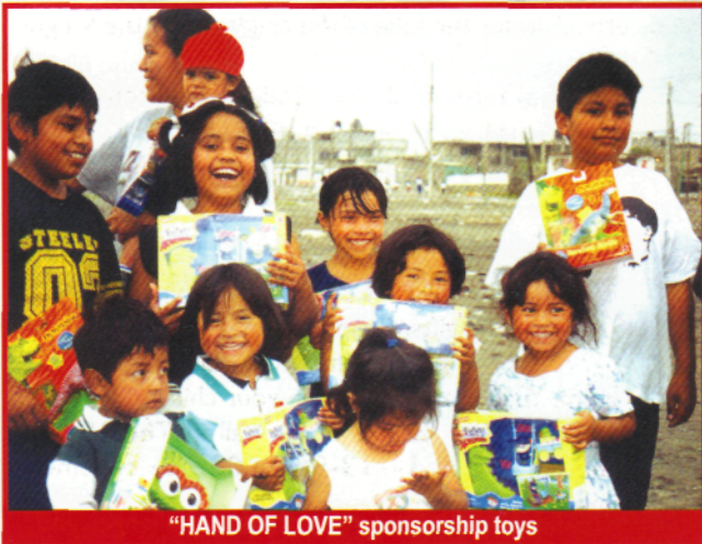
"HAND OF LOVE" sponsorship toys