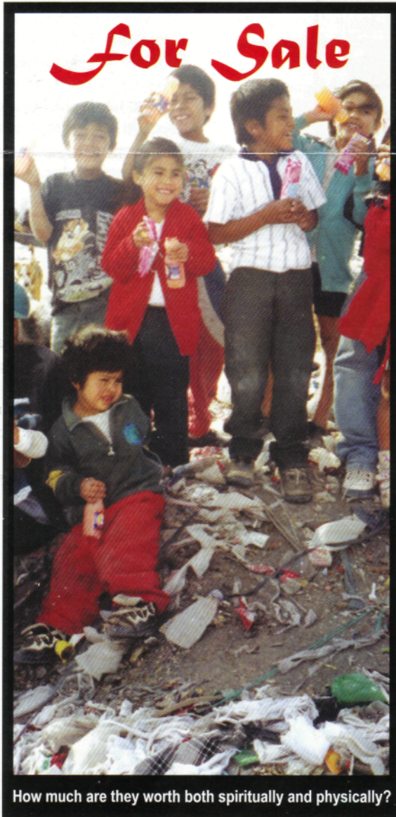
How much are they worth both spiritually and physically?