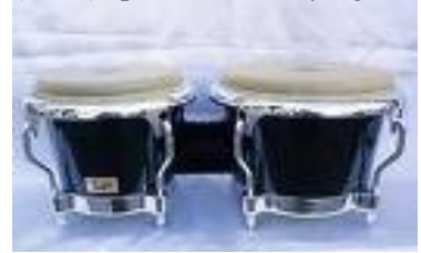
“Praise Ye The Lord”