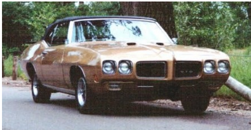
1970 Pontiac GTO