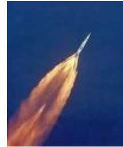
Saturn V Rocket

Man's amazing display of engineering that succeeded in putting a man on the moon made a great – even haunting – mark on my life. I look at this as an example of how an event can be used to influence a person for good or for bad, depending on the way a person perceives it, and makes use of it. It's been said our "worldview" (how we relate to and interact with the outside world) influences the choices that we make in life, yes, and in greater ways than we know or understand. The importance of the choices we make now and tomorrow cannot be overly stressed. The phrases "You reap what you sow" and "You made your bed, now lie in it", are true to life. The choices that we make today are going to follow us tomorrow, and into eternity .