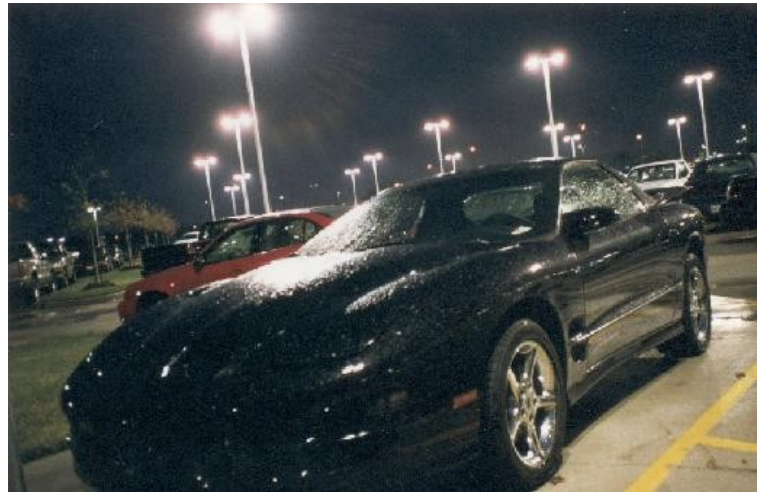
2000 Pontiac Firebird Trans Am Firehawk